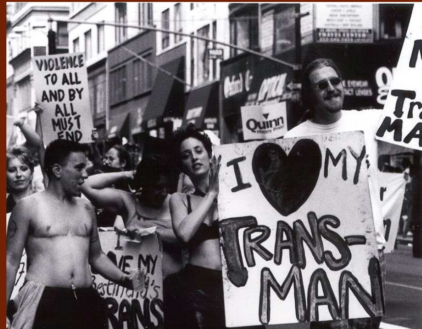
Photo from the 1999 NYC Pride March